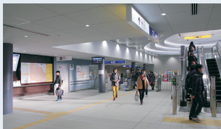
Kawauchi Station (interior)