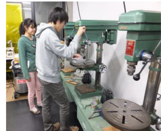
Processing a chassis for the vacuum amplifier with learning usage of tools and machines