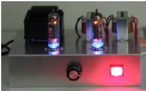
An example of audio amplifier with vacuum tubes