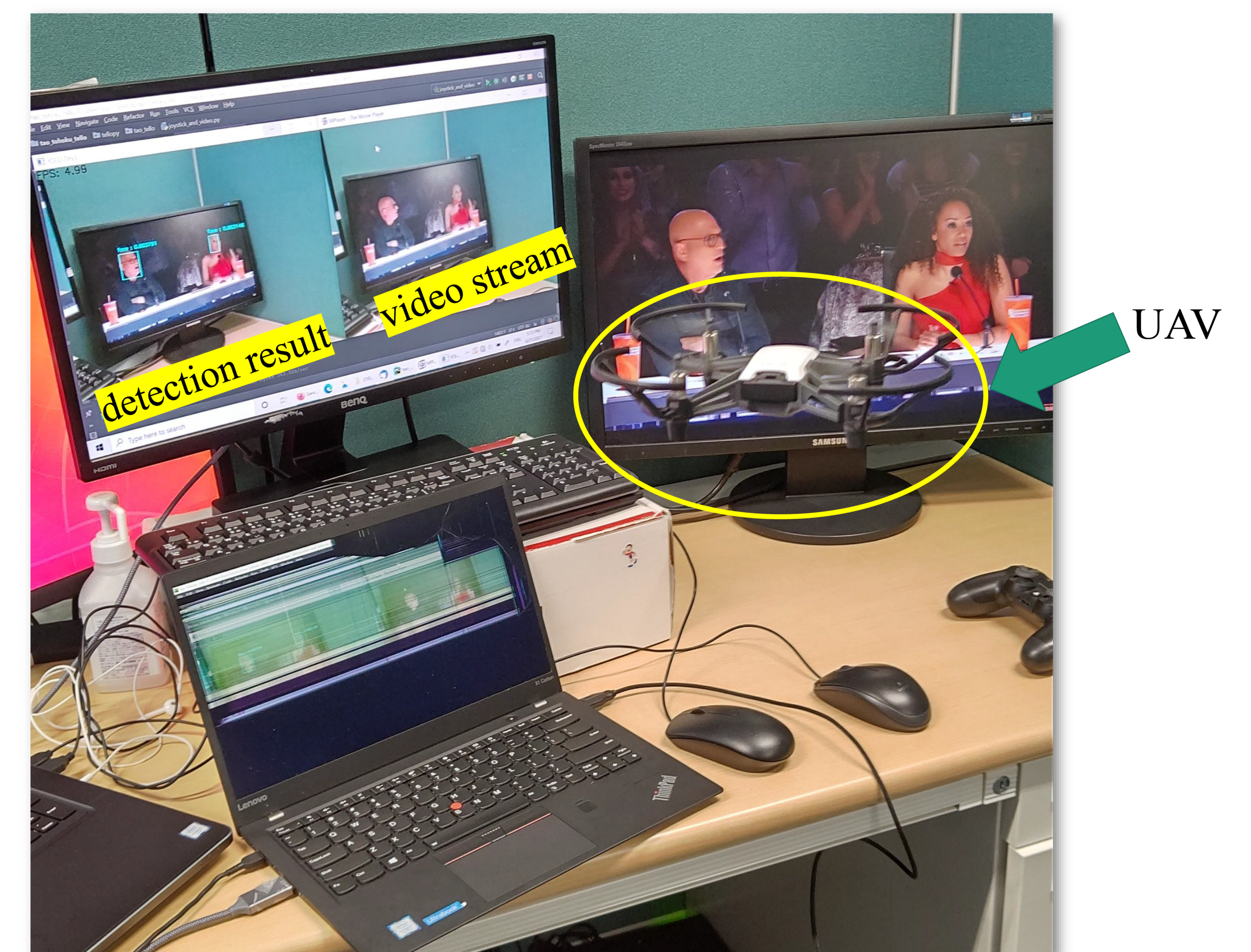
UAV-based object detection system