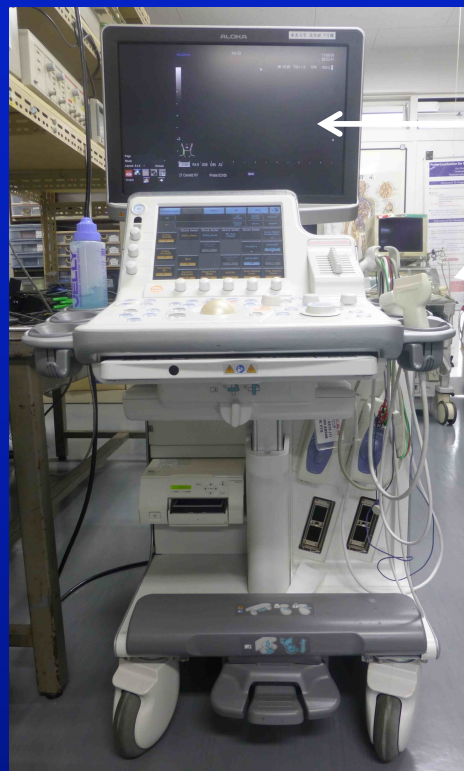
Diagnostic ultrasound imaging system