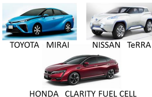
Figure 1 Fuel Cell Vehicles (FCV)

In recent years, hydrogen energy society has attractive attentions, from the backgrounds of global warming and depletion of fossil fuels. Ideally, hydrogen should be generated by water electrolysis powered by renewable energy sources, such as photovoltaic cells. In addition, in case of using hydrogen, fuel cells are favorable energy devises which can covert hydrogen's chemical energy to electrical energy with high efficiency (Figure 1).