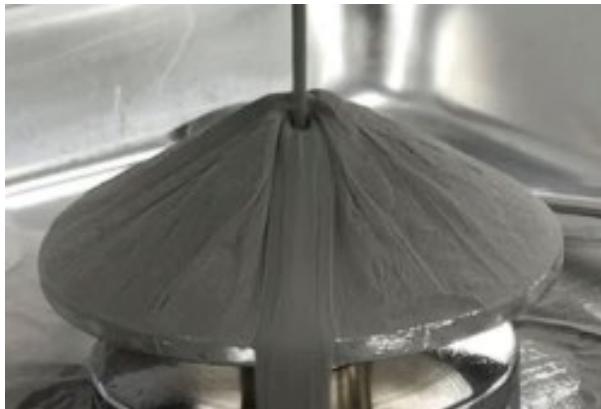
Figure 1 Angle of repose

“Powder” exists in many aspects around us. It is used in many fields as a material for industrial products such as metals, ceramics, and polymers, as well as foods, cosmetics, and sands. There are many approaches to obtain powders and process them according to different purposes, but surprisingly, we do not know the properties of the powder itself. In this lecture, we will investigate the size, shape, tap density, and flowability of different powders around us. Let us learn together !