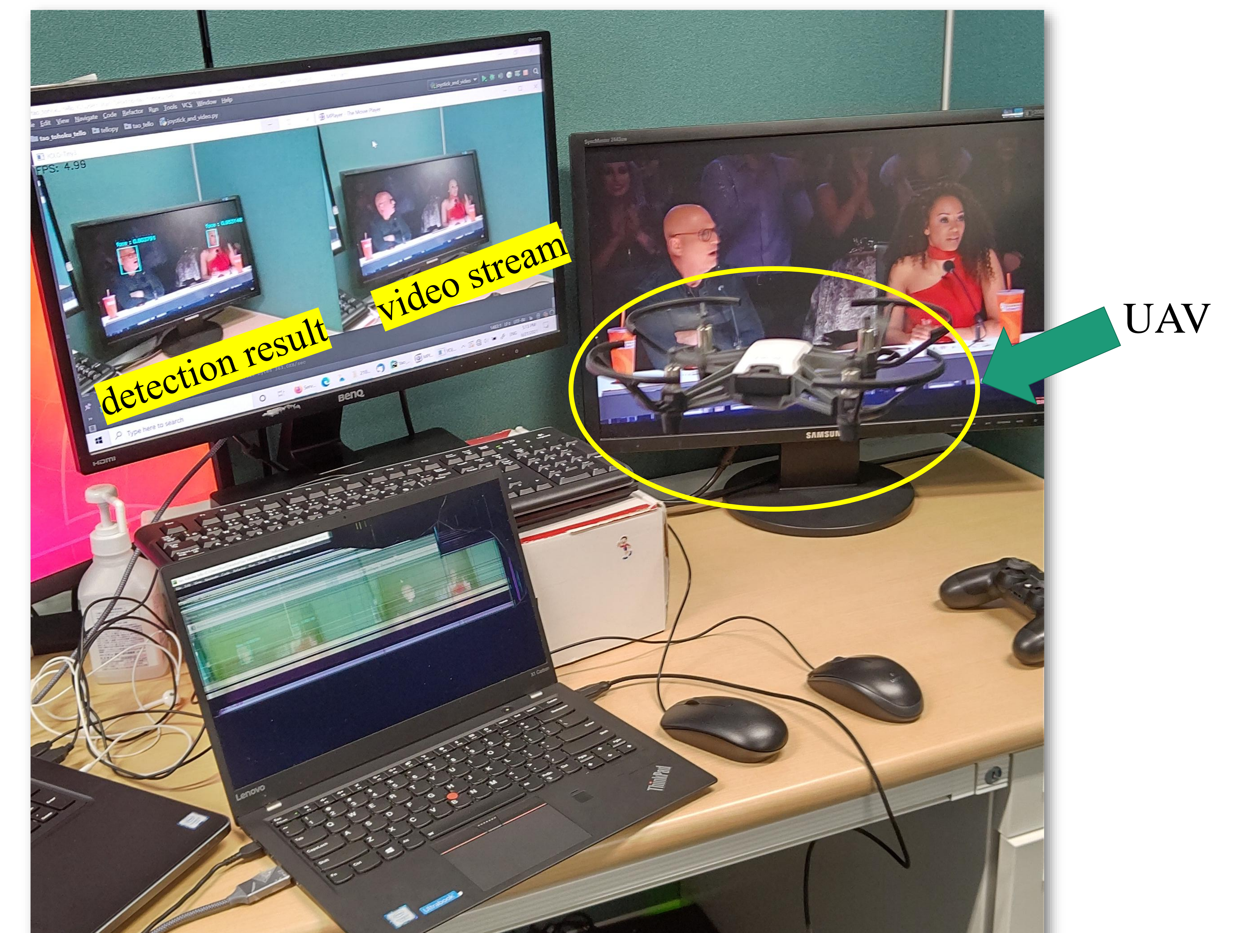
UAV-based object detection system