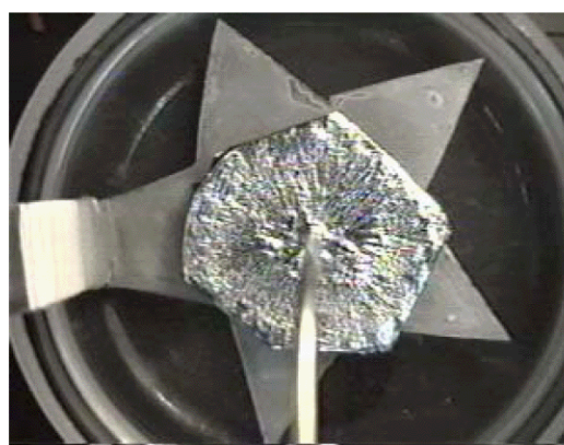
Fig. 2 Metal Leaves produced with a starlike electrode.