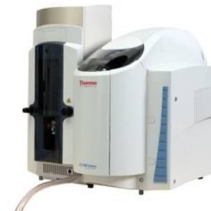
Atomic Absorption Spectrometry