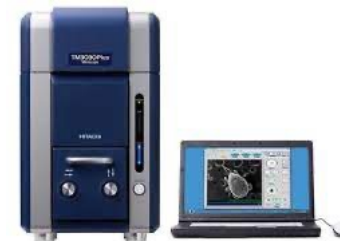
Scanning Electron Microscope

Trying to sorb cesium ions from cesium solution using zeolite.