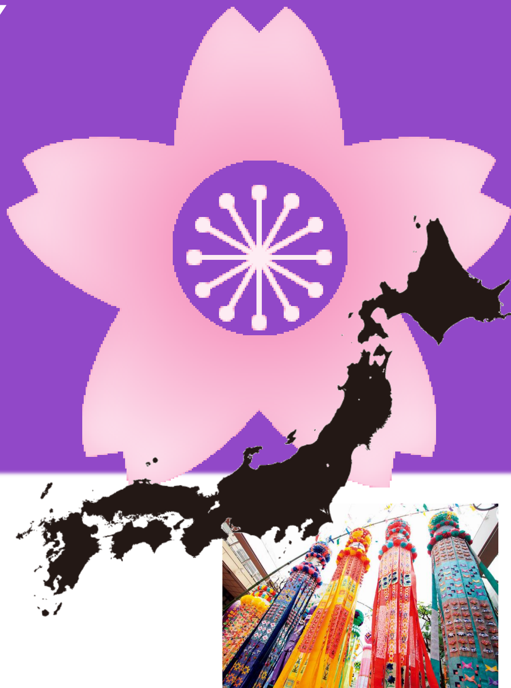
Sendai Tanabata Festival: August 6 th – 8 th

Since its founding in 1907, Tohoku University has engaged in world's top class education and research activities. Sendai city, where Tohoku University is located, has many cultural sites where you have the chance to extensively experience Japanese culture.