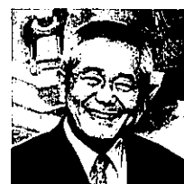
Purdue University Distinguished Professor Mr. Ei-ichi Negishi (Teijin Group Distinguished Fellow 5th year Teijin Kumura scholarship (1957))

*This message was contributed in November 2013.