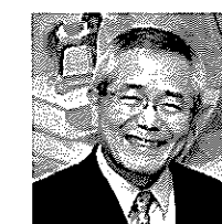
Purdue University Distinguished Professor Mr. Ei-ichi Negishi (Teijin Group Distinguished Fellow) 5th year Teijin Kumura scholarship (1957)

*This message was contributed in November 2013.